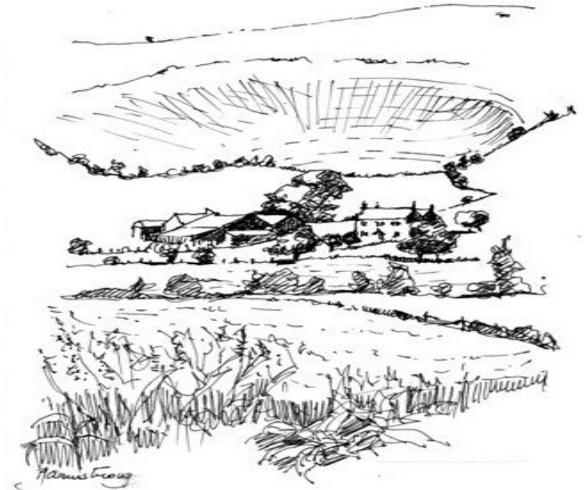
Whitecliff Farm, Brixton Deverill